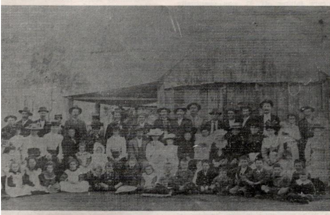
GROUP OF DRILLHAM RESIDENTS about turn of century

The first building used as a school in Drillham was privately owned and was available for only a short time.