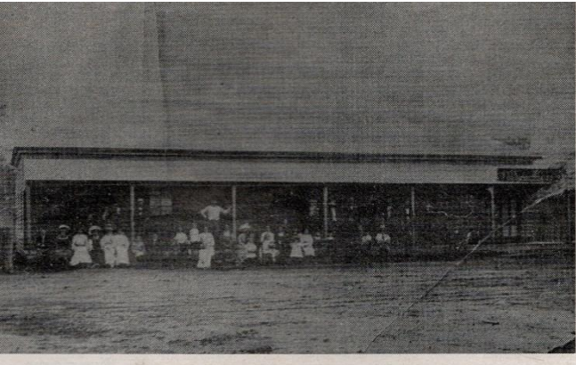
RAILWAY HOTEL-the first hotel (1908)