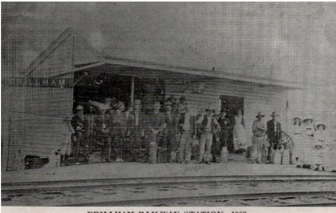
DRILLHAM RAILWAY STATION-1909